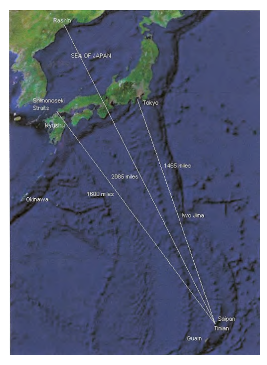
From Tinian to Tokyo...and Back