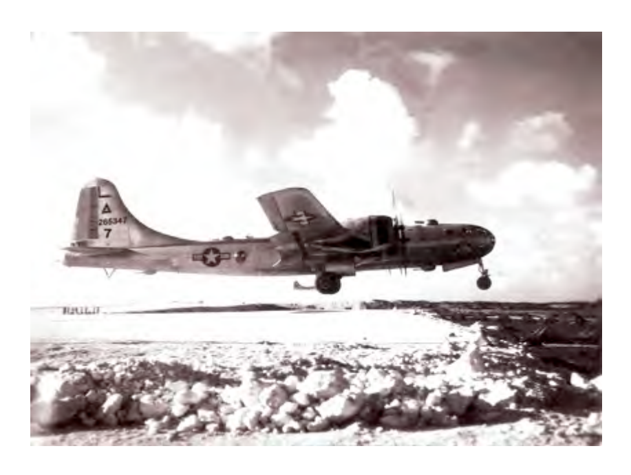
Fortune's Follies Taking Off, March 1945 (Note the Low Altitude Achieved at Runway's End)