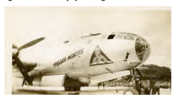
Trigger Mortis (42-93911) L TRI 18 (The B-29 that Crew 2408 ferried back to the States)

Dad arrived in the States on August 18, 1945. He was sent to Camp Atterbury near Edinburgh, Indiana, south of Indianapolis, where he mustered out on September 23, 1945; he had just turned 26. In less than a year he had faced difficult circumstances with courage and skill, though not without psychological effects.