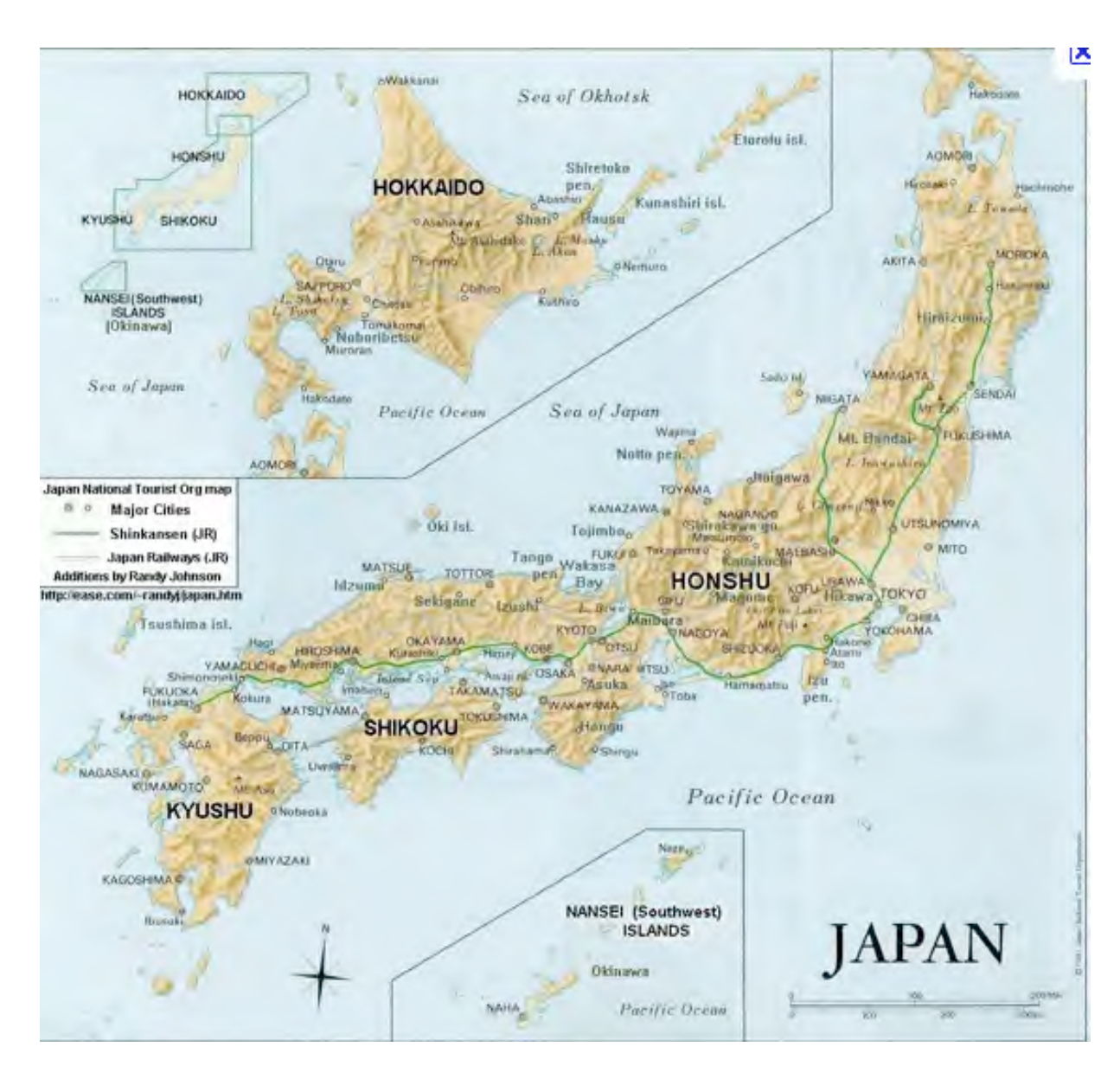
The Japanese Mainland