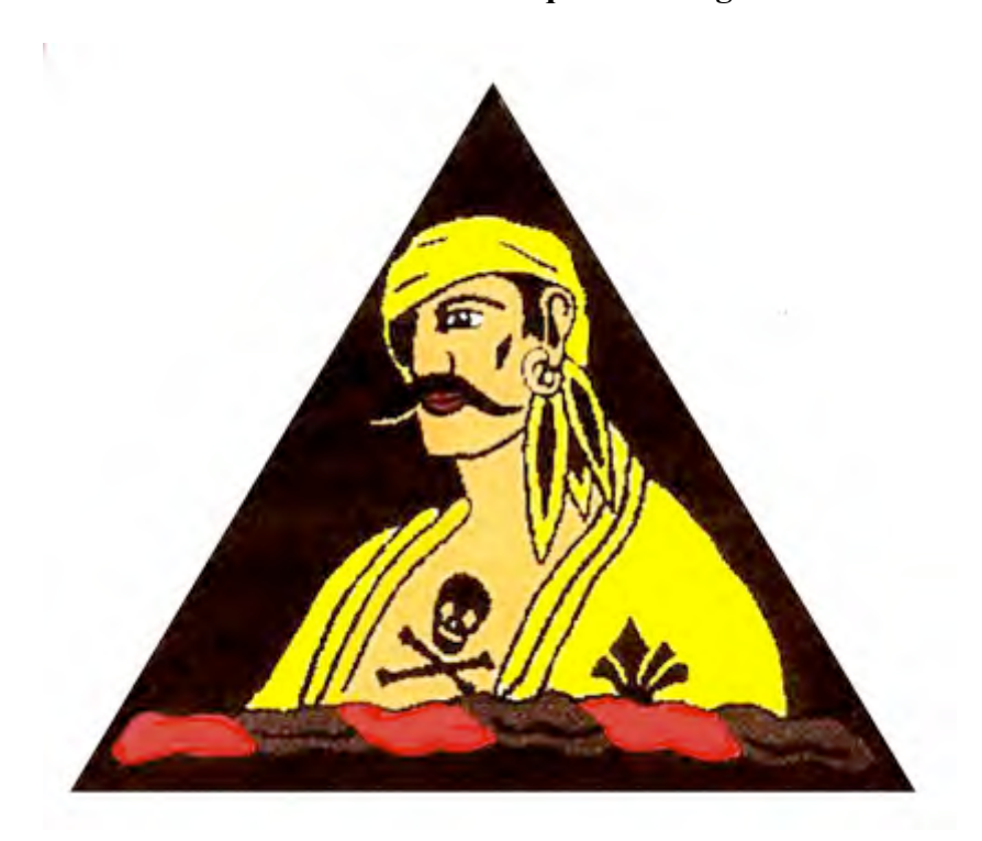
6<sup>th</sup> Bombardment Group Logo