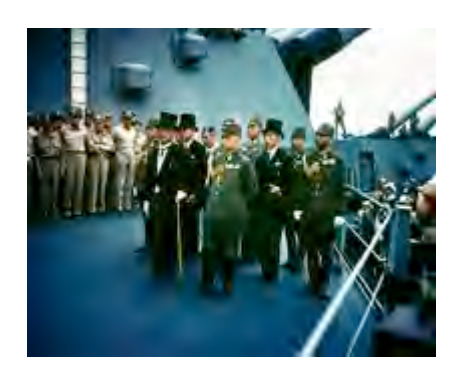
The Japanese Surrender, U.S.S. Missouri , September 2, 1945