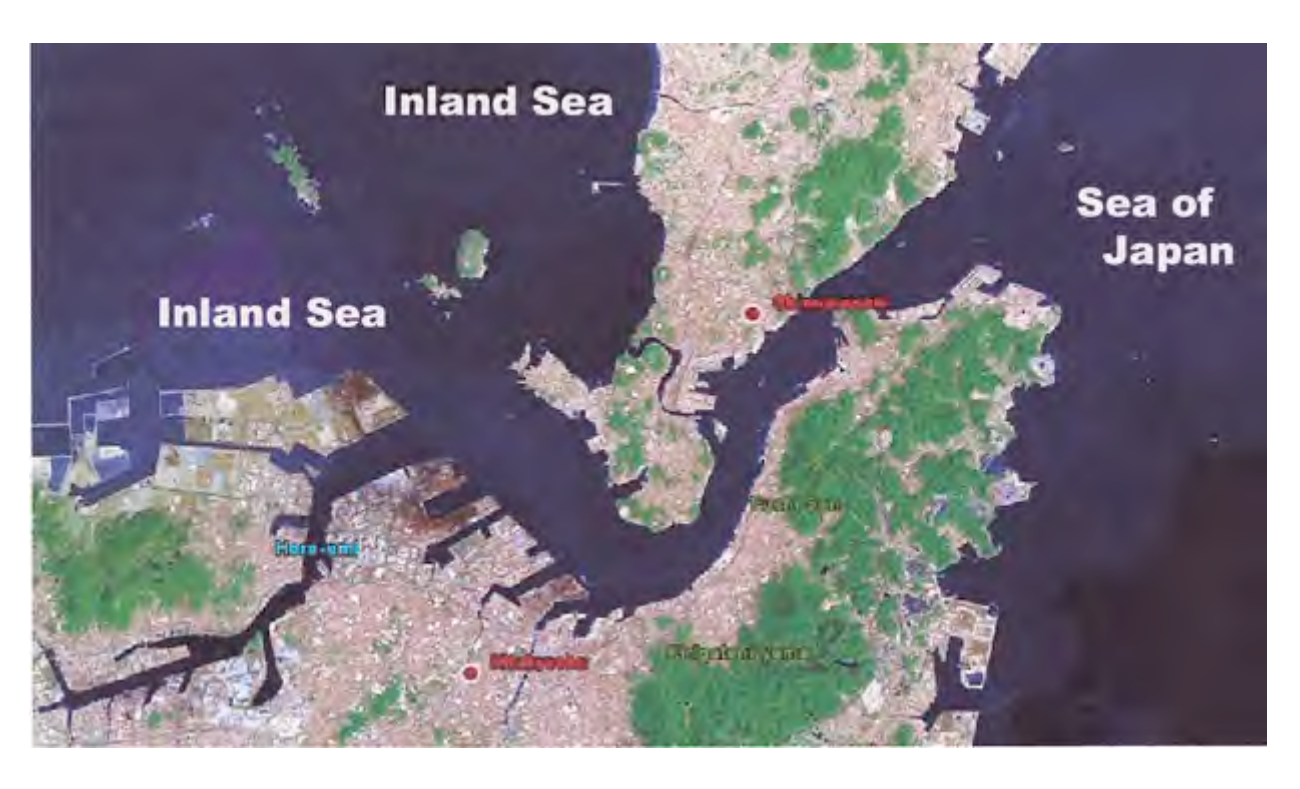
Shimonoseki Straits: The Western Access to Japan's Inland Sea (Primary Area of Operation Starvation's Mining Missions)