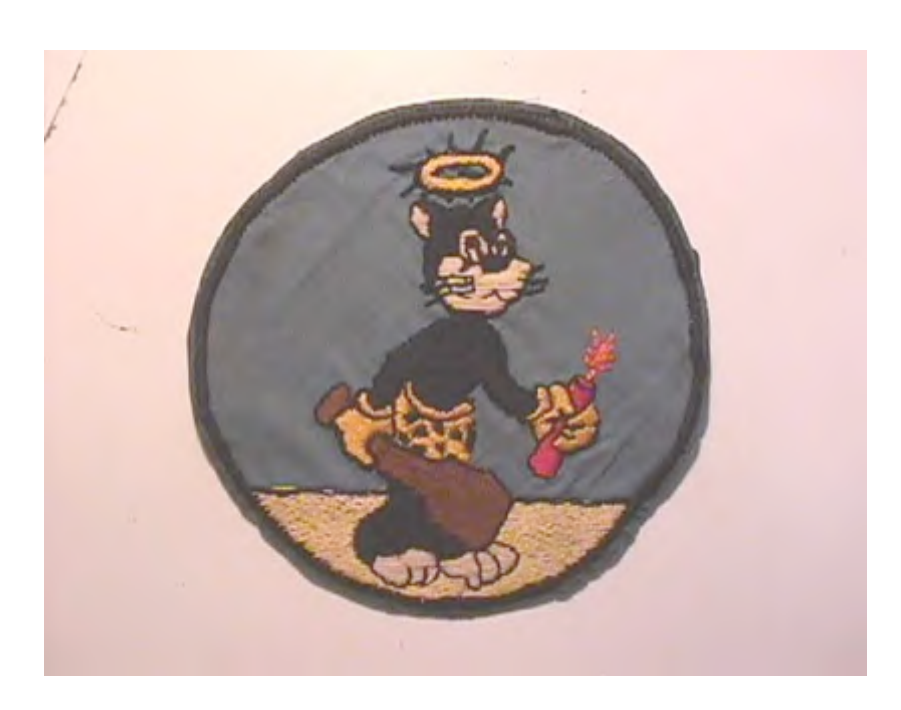
24<sup>th</sup> Bombardment Squadron Logo