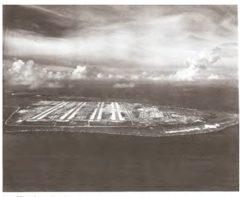
The Last Look. What you see when you turn to look hank at North Field, Tinian, just after take off

Along with Saipan, its close neighbor only five miles away, Tinian was the most forward island in the Marianas chain—1,500 miles from Tokyo. Immediately after being secured by the Marines in late July 1944, the Navy's Seabees began building Tinian North Field, where the 313<sup>th</sup> Bomb Wing would be located. Soon after completion of Tinian North Field, a second airfield, Tinian West Field, was constructed.