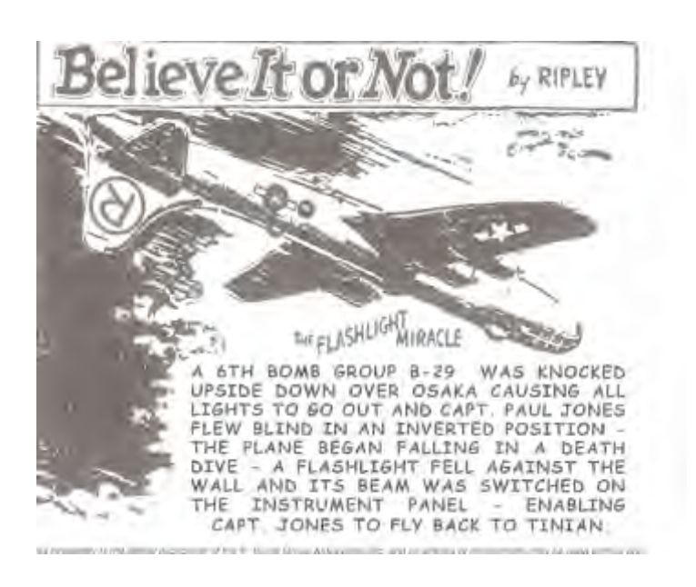
This was Bataan Avenger, one of Dad's secondary planes

Execution of Operation Starvation was tasked to the 313<sup>th</sup> Bomb Wing, which flew over fifty mining missions. Dad flew seven of those missions, including the first (to the Shimonoseki Straits on March 27-28) and the last (to Rashin on July 22-23).